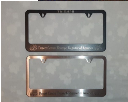
Grille badge (3 inch diameter) Lapel pin (3/4 inch diameter) Licenses plate frame

Membership fee _____ Name tags @ $6.00 each _____ Grille badges @ $25.00 each _____ Lapel pins @ $5.00 each _____ License plate frame @ $15 each _____ Total enclosed _____