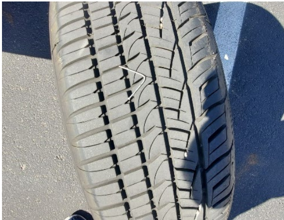
So, that's a framing nail.

The day was also marked by a discovery I had picked up a framing nail along the way to the event. The worst part was it was in the side wall, so that tire is done.