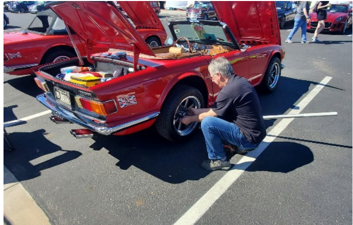
Friends can be very helpful.