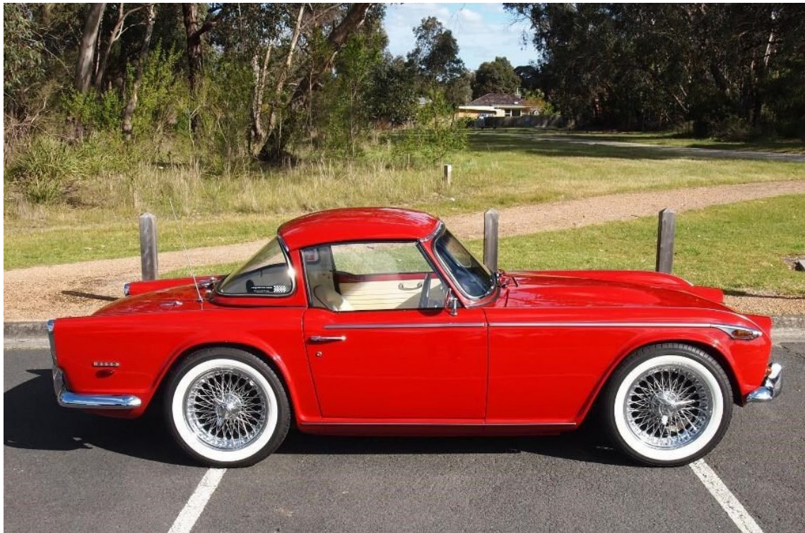
1967 Triumph TR5