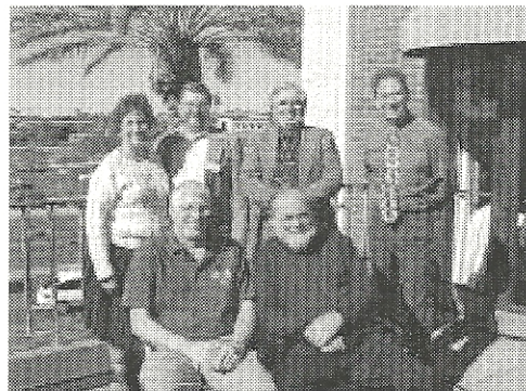
DCTRA OFFICERS FOR 2001

April 7-8, 2001 - Fourth Annual British-European Auto Tour (BEAT). Here is another opportunity to cruise the backwoods of Arizona. Flyer and entry form included in this issue.